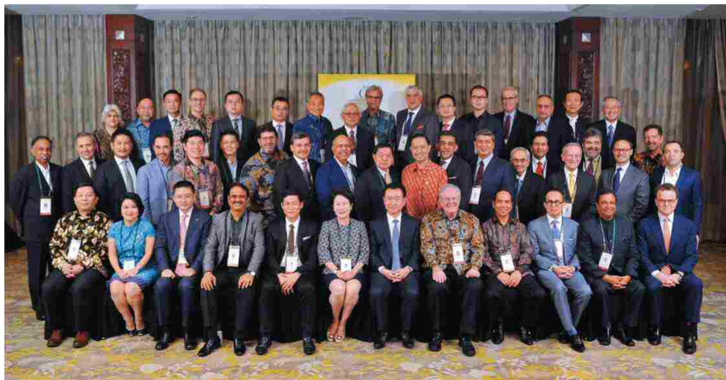
Speakers and sponsors at the Private Speakers Welcome Reception

NOVEMBER 29 – DECEMBER 1, 2016 JAKARTA, INDONESIA