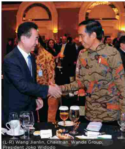
(L-R) Wang Jianlin, Chairman, Wanda Group; President Joko Widodo