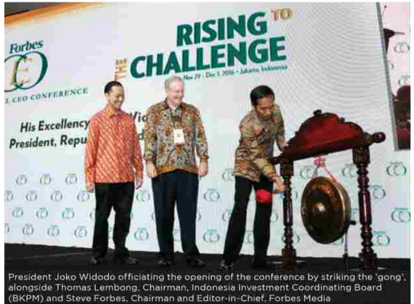
President Joko Widodo officiating the opening of the conference by striking the 'gong', alongside Thomas Lembong, Chairman, Indonesia Investment Coordinating Board (BKPM) and Steve Forbes, Chairman and Editor-in-Chief, Forbes Media.