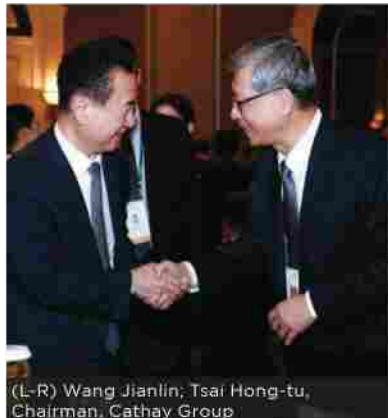
(L-R) Wang Jianlin; Tsai Hong-tu, Chairman, Cathay Group